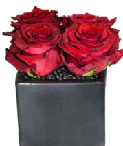
C 6" tall x 5" wide $60.00 each