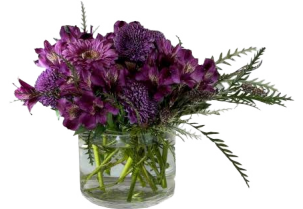
N 12" tall x 10-12" wide $95.00 each