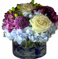
P 12" tall x 10-12" wide $125.00 each