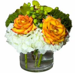
R 14-16" tall x 6" wide $135.00 each