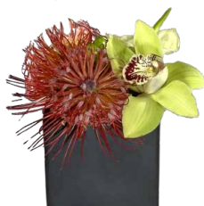
D 6" tall x 5" wide $65.00 each