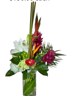
Z 20-24" tall x 16-18" wide $175.00 each

Please note seasonal adjustments may apply to the above arrangements.