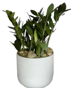
H 10-14" tall x 5-6" wide $65.00 each