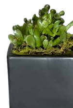
F1 6" tall x 4" wide $45.00 each