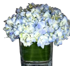
G2 6" tall x 5" wide $50.00 each