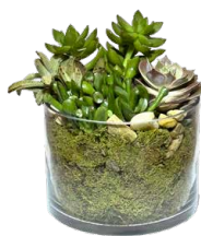
I1 7" tall x 5-6" wide $85.00 each