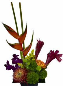
W 18-20" tall by 12" wide $135.00 each