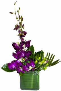
S 16-18" tall x 6" wide $95.00 each