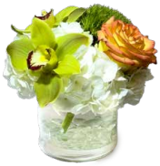
K 8" tall x 8" wide $85.00 each

PROFESSIONAL FLORAL DESIGNS A-Z: ORDER ON PAGE 6