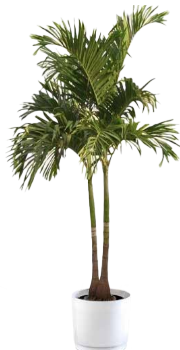
8 - 10ft Andonidia Palm

*Discount pricing only applies to orders received and paid in full thirty days prior to Exhibitor Move In