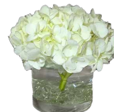
G3 6" tall x 5" wide $50.00 each