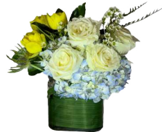
L 12" tall x 10-12" wide $85.00 each