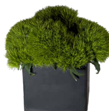
E 6" tall x 5" wide $65.00 each